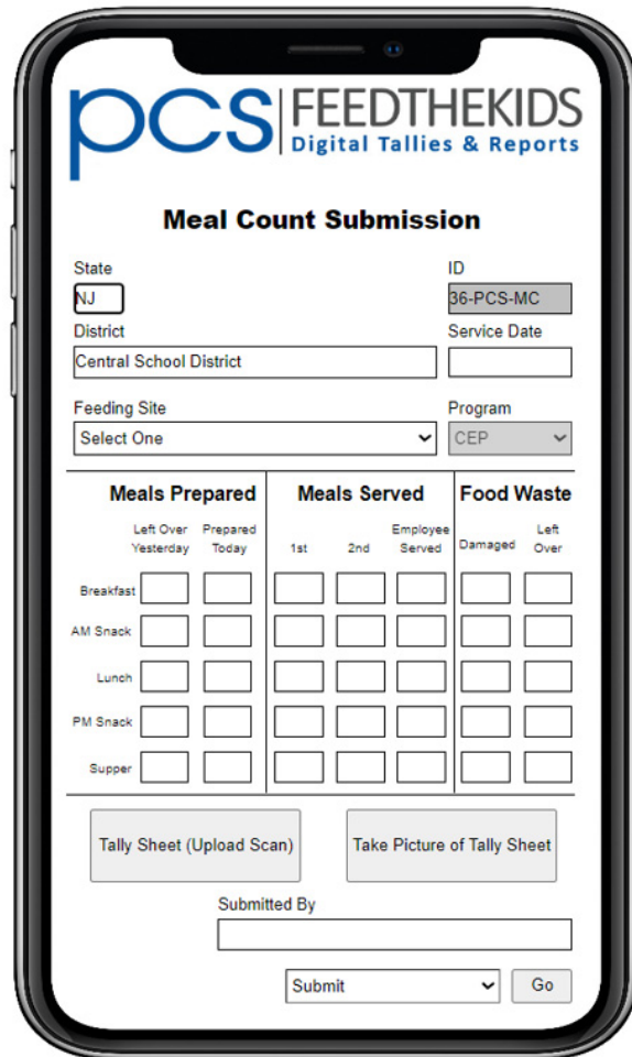
Responsive formatting for smart phones and tablets.